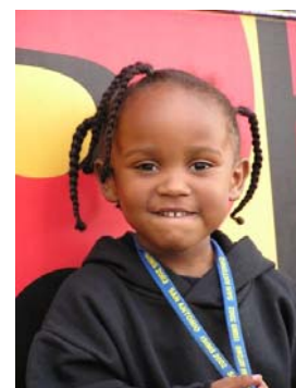
A happy KIND patient -- new to Denver from New Orleans

Kids in Need of Dentistry 2465 S. Downing St. Denver, CO 80210